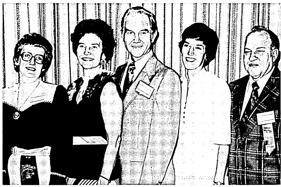
NEW OFFICERS FOR 1976-77:

The election of officers was held Thursday morning at the first business session. The Nominating Committees slate was elected by unanimous vote.